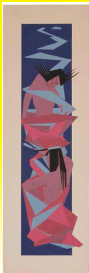
Smoke Signals, by Oscar Howe, ca. 1953.