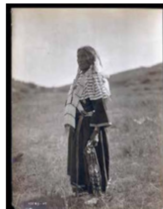
Slow Bull's Wife, photographed by Edward E. Curtis in 1907. Courtesy of the Library of Congress.